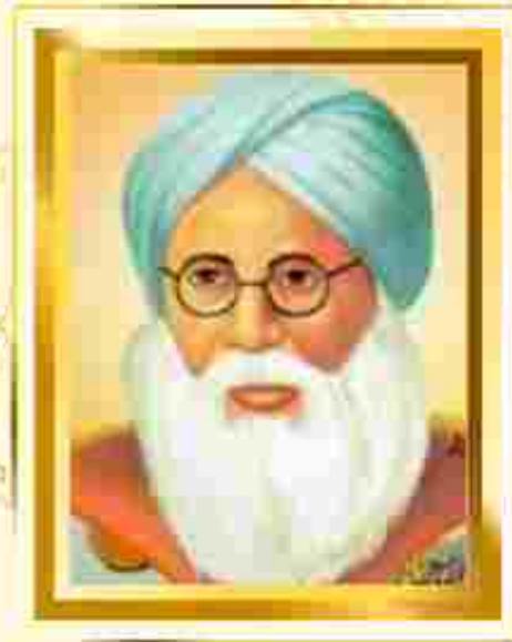
Mahatma Hansraj Ji (1864-1938)

GREAT EDUCATIONIST & FATHER OF DAV SCHOOLS