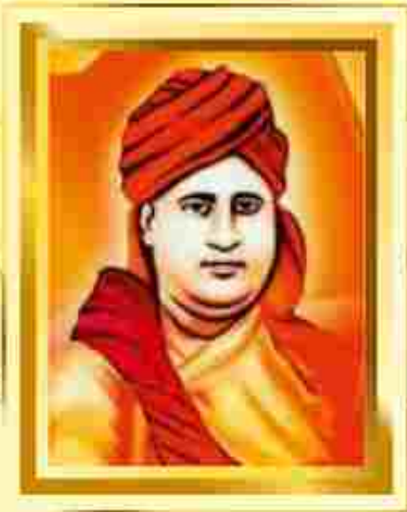
Maharishi Swami Dayanand Saraswati Ji (1824-1883)

GREAT EDUCATIONIST & FATHER OF DAV SCHOOLS