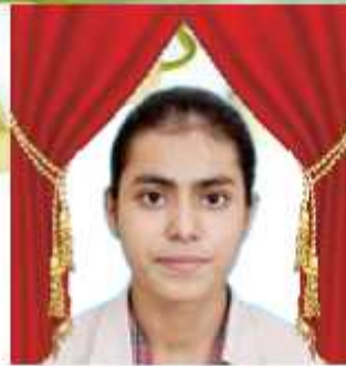
Garima +2 School Topper (95.4%) NEET & JEE (Mains) Qualified)