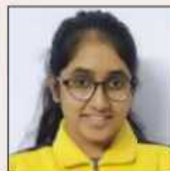
Sanch State Level Basketball Player