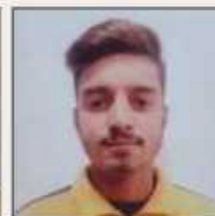
Smile Singh State Level Cricket Player