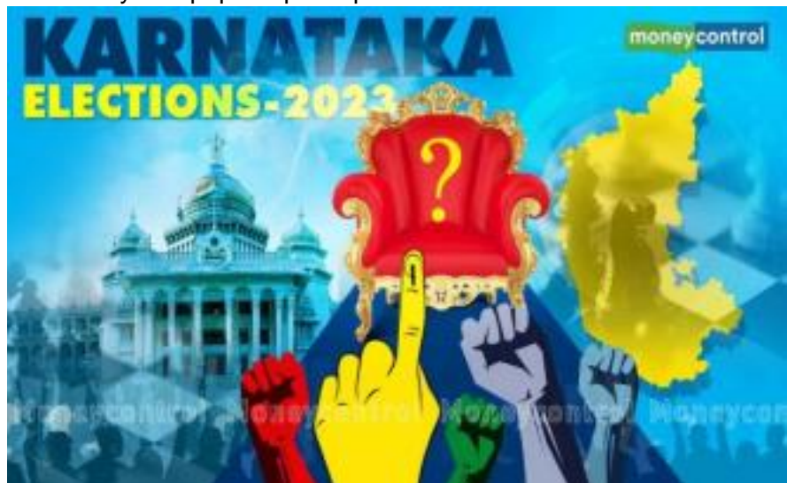
Make a collage book displaying the various aspects of the Karnataka Elections held in May 2023.

The Karnataka Elections were held this year in May 2023. It was an amazing display of democracy and popular participation